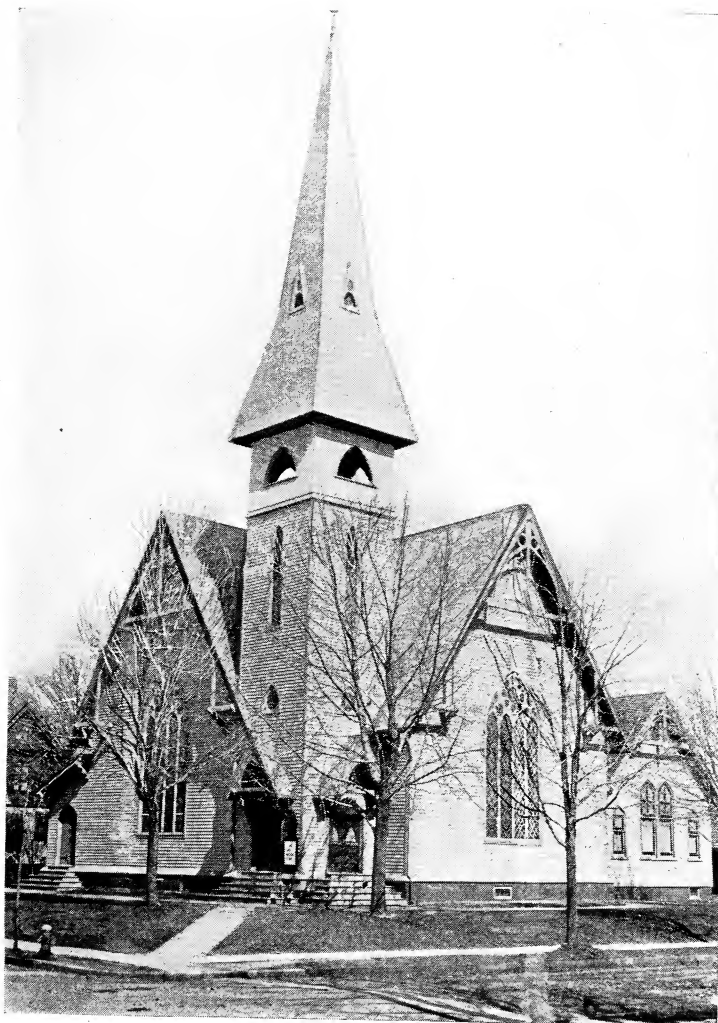
CHURCH EDIFICE IN BOUND BROOK